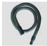
Light treatment tube D 33