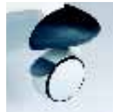
Wheel with brake

Zimmer MedizinSysteme GmbH Junkersstraße 9 D-89231 Neu-Ulm Tel. +49. 7 31. 97 61-291 Fax +49. 7 31. 97 61-299 export@zimmer.de www.zimmer.de